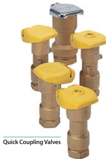
Quick Coupling Valves